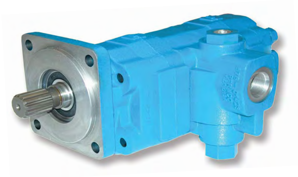
P5100 SERIES TWO-SPEED